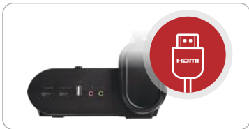
Image Streaming via HDMI Connectivity

Bend and adjust the gooseneck whatever you need to make the sample be seen crystal clear. Students will miss any details no more.