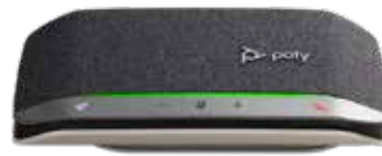
POLY SYNC 20