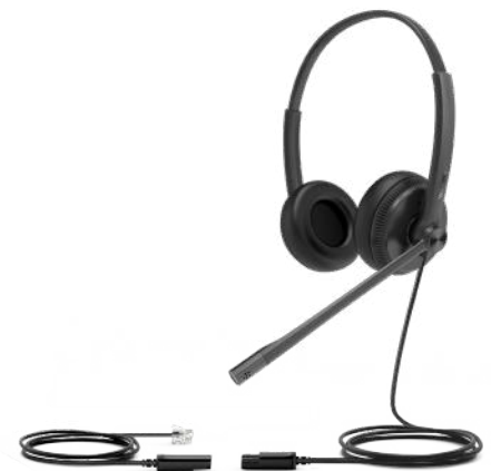
YHS34/YHS34 Lite Dual