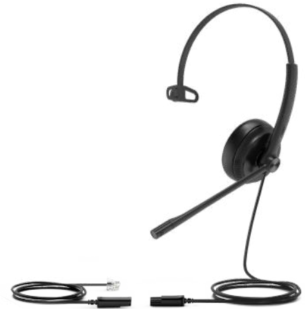
YHS34/YHS34 Lite Mono

Built for comfort with soft ear cushions and ultra-lightweight materials, the YHS34/YHS34 Lite is 10%~30% lighter than other headsets in the same range. Its ergonomic design makes this headset comfortable enough for long conference calls and all day use.