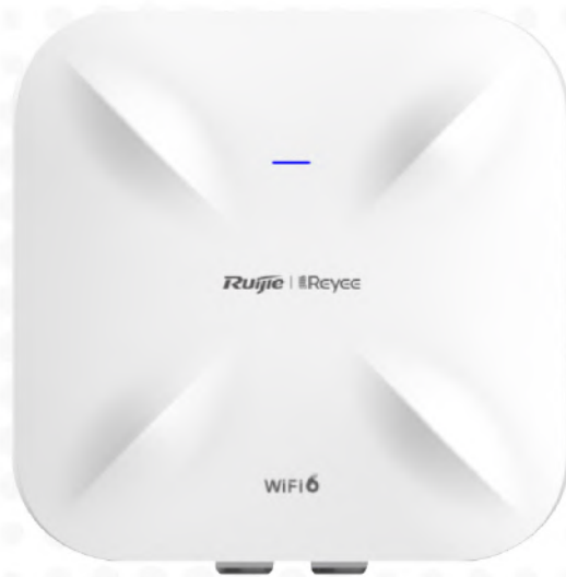
Figure 1-1 RG-RAP6260(G)