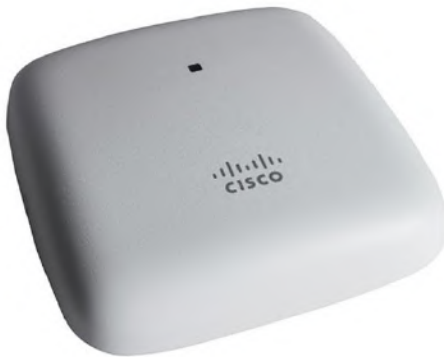
Figure 1. Cisco Aironet 1815i Access Point

The 1815i extends support to a new generation of Wi-Fi clients, such as smartphones, tablets, and high-performance laptops that have integrated 802.11ac Wave 1 or Wave 2 support.