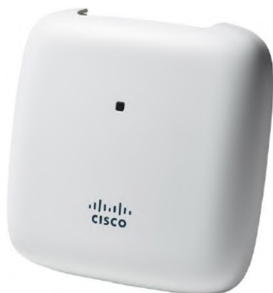
Figure 1. Cisco Aironet 1815m

With the increased coverage area, 802.11ac Wave 2 support, and the functions and features of an enterprise-level access point, the 1815m fully meets the growing requirements of wireless networks by delivering a better user experience (Figure 1).