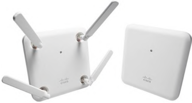
Figure 1. Cisco Aironet 1850 Series