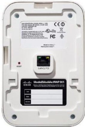
Figure 4. Side Panel of the WAP361 Wireless-AC/N Dual Radio Wall Plate Access Point