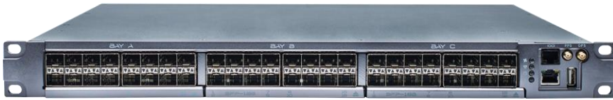
Figure 3. Cisco Nexus 3550-F Modular Layer 1 Matrix Switch / Cisco Nexus 3550-F Programmable Multiplexer Switch

The Mux mode offers 1G and 10G Ethernet options, with the ability to rate convert between these rates. It also offers Layer 2 and VLAN based demultiplexing. These features are designed for low latency long range wireless telecommunication networks where many customers require access to the same low-speed radio link.