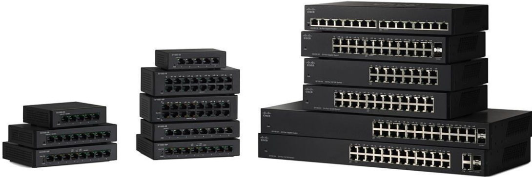
Figure 1. Cisco 110 Series Unmanaged Switches