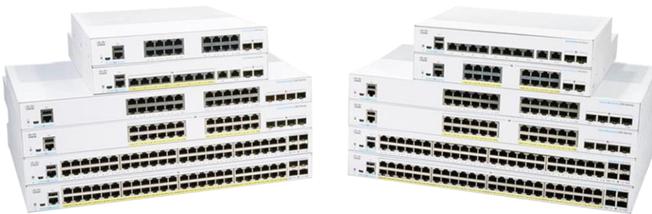
Figure 2. Cisco Business 350 series managed switches

The Cisco Business 350 Series Switches, part of the Cisco Business line of network solutions, is a portfolio of affordable managed switches that provides a critical building block for any small office network. Intuitive dashboard simplifies network setup, and advanced features accelerate digital transformation, while pervasive security protects business critical transactions. The Cisco Business 350 Series Switches provide the ideal combination of affordability and capabilities for small office and helps you create a more efficient, better-connected workforce. When your business needs advanced networking features and security for the digital transformation yet value is still a top consideration, you're ready for the Cisco Business 350 Series Switches.