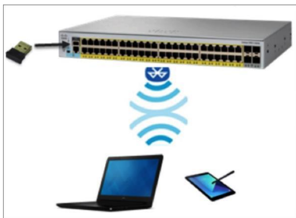
Figure 2. Over-the-air switch access using Bluetooth